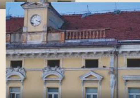
Actual images of system operation