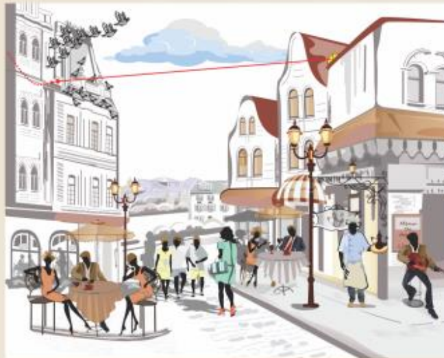
Conceptual demonstration of operation

High-tech product developed and manufactured in Slovenia. Consisting of a camera, autonomous computer vision and a guided laser. System development is completed. In 2020, we had several test installations on city facilities, and in 2021 the production of the first serial products will start.